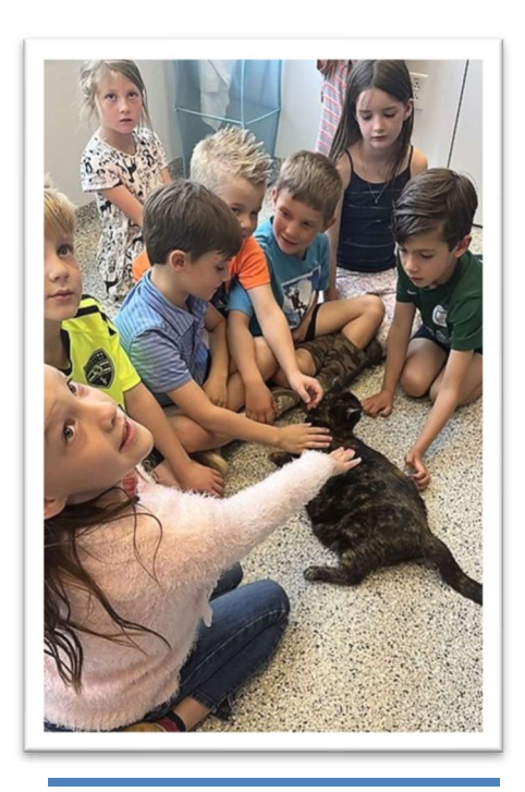
87 students visited our Campus in April for our Youth Enrichment Programs.